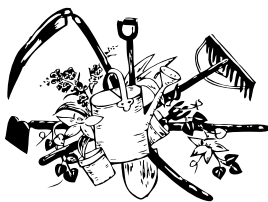
Penn-Cumberland Garden Club

Penn-Cumberland Garden Club was organized in 1959, federated in September, 1960 and is a member of the Garden Club Federation of PA, District IV, and the Central Atlantic Region of National Garden Clubs, Inc.